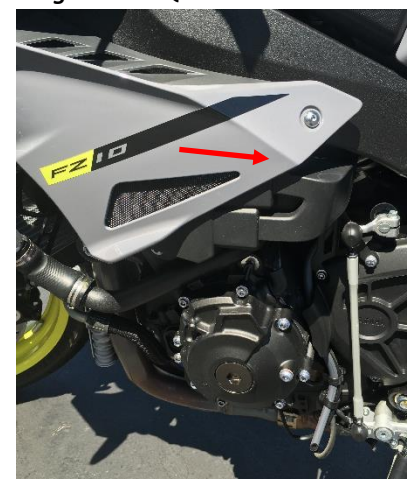
Fig2. Left side ECU Cover