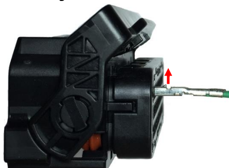
3 Row ECU Coupler