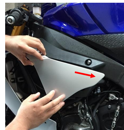
Fig3. ECU Cover Panel