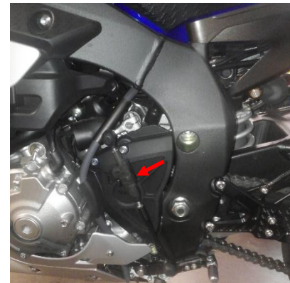
Fig1. Stock QS Sensor Location