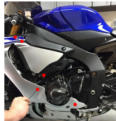
Fig2. Body Work Bolt Locations