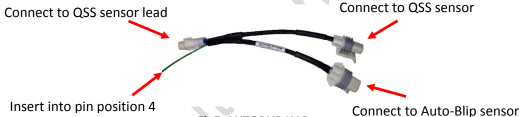
Fig7. AUTOBLIP HAR